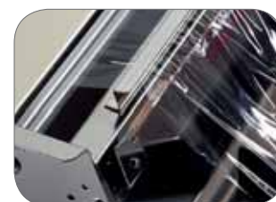
1. Profilo teflonato Teflon-coated section