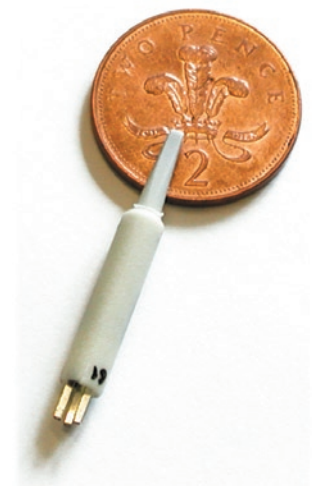
The illustration shows the main part of the magnetometer. The field sensing element is of sub-millimetre dimensions and is placed at the tip of the sensor.

This enables it to use an excitation frequency of several tens of MHz resulting in a sensor with a bandwidth of dc to 5MHz combined with low noise and wide dynamic range.