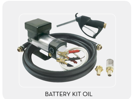
BATTERY KIT OIL