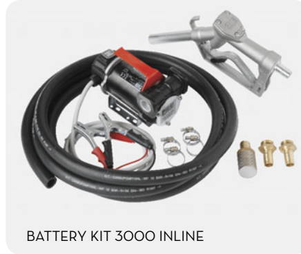
BATTERY KIT 3000 INLINE