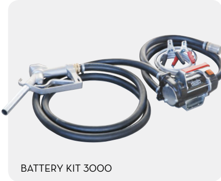
BATTERY KIT 3000