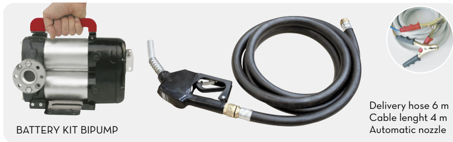
BATTERY KIT BIPUMP

Delivery hose 6 m Cable lenght 4 m Automatic nozzle