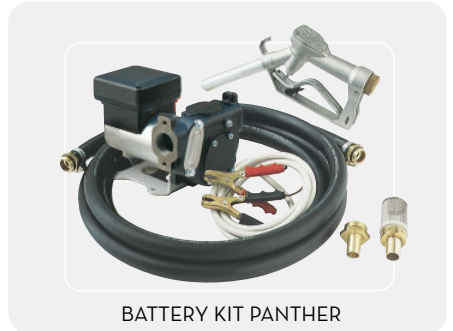
BATTERY KIT PANTHER