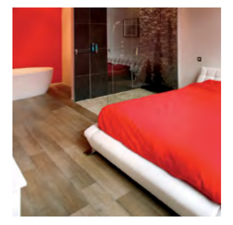
Water-resistant laminate for every interior