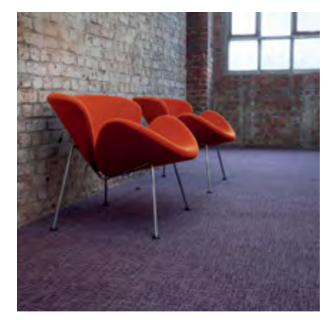
Domestic: colours for every mood and every interior