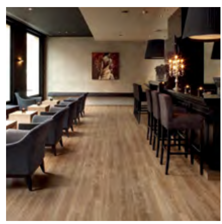
The look and feel of a wooden floor