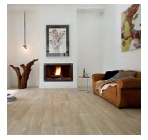
5 metre wide cushion vinyl for seamless installation

Beaulieu Flooring Solutions is also an expert in vinyl. We can offer you unique products, with a worldwide exclusivity on 5 metre-wide cushion vinyl. We market our cushion vinyl under the Beauflor and luteks brands.