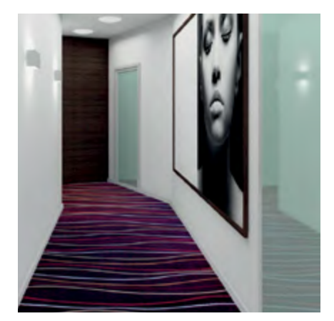
Hospitality: lifts every interior to a higher level

Beaulieu Flooring Solutions offers a wide range of high quality wall-to-wall tufted carpets. Our residential carpets are sold under the Ideal® brand name, and our commercial range is marketed under the Carus® brand name.