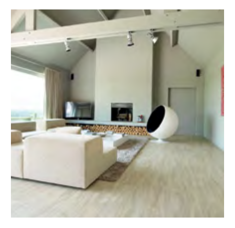
Quickly installed: ideal for commercial applications