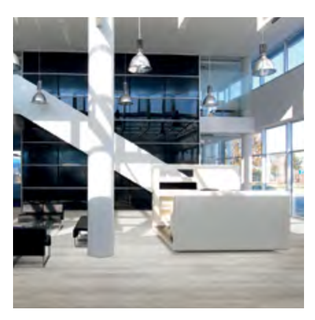
An ideal fit with floor heating