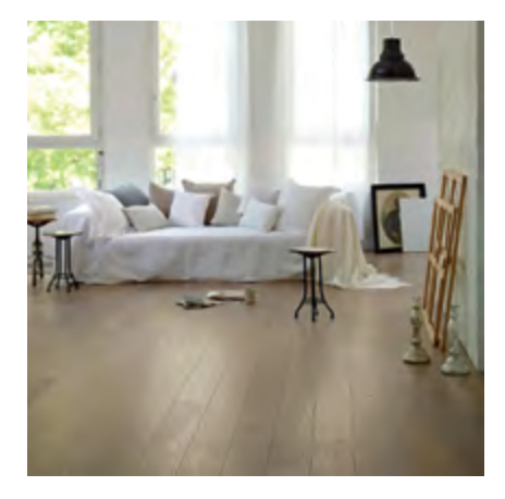
The High-Tech LOC® aluminium lock system: rock solid

Under the BerryAlloc® brand name, Beaulieu Flooring Solutions provides a wide range of parquet and laminate flooring in several quality levels.