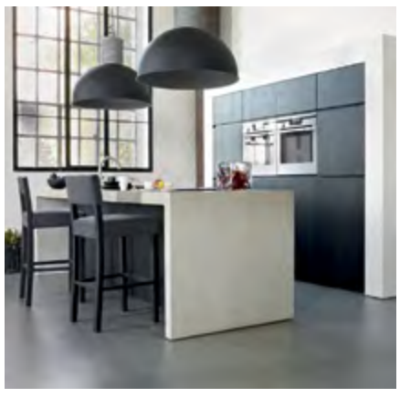
Trendy collections with innovative designs