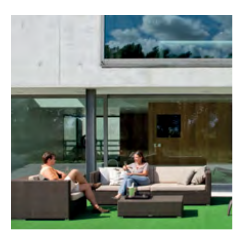
Artificial grass deliverable on rolls and as mats