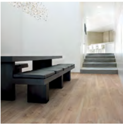
Robust Millennium parquet with a 6 mm thick top layer