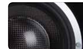
LE carbon-fibre cone