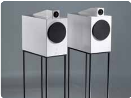
OCTAVE SIGNATURE BOOKSHELF

The heart of the Octave Signature is the 5¼" bass midrange driver, equipped with an enormous 3" voice coil inside of which is placed the magnet system. This unusually large voice coil configuration is three times larger than on conventional drive units of this size. Bass output from this drive unit is surprisingly deep and powerful yet very articulate.