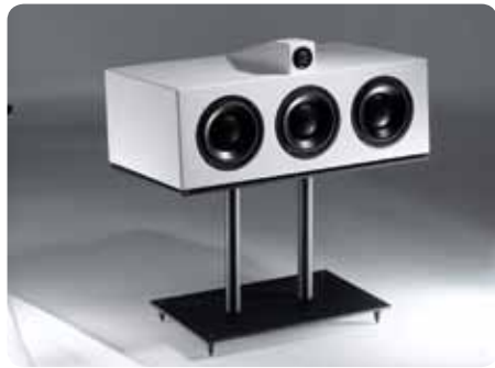
OCTAVE SIGNATURE CENTRE

Profiled to allow the Octave Signature Bookshelf to sit on top to create a single visual structure, the Octave Signature Subwoofer takes up no more floor space than a pair of speaker stands. Technical highlights include Isobaric loading which reduces the cabinet size by half for the same bass extension. A built in passive crossover designed to create a seamless transition from the Octave Signature Subwoofer to the Octave Signature Bookshelf.