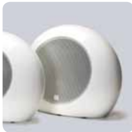
SOUNDSUB™ PSW8E / PSW10E

The SP-1 is a discreetly designed miniature half-sphere satellite speaker that can be easily installed in a variety of locations. Despite its modest dimensions, the SP-1 is a true 2-way system housing a high performance coaxial driver, producing a wide frequency range with exceptional dispersion characteristics. At home, as part of a 5.1 home cinema system the SP-1 delivers a surprisingly "big" powerful sound. Can also be used with high performance computers where its lively articulate sound takes full advantage of modern computer sound cards.