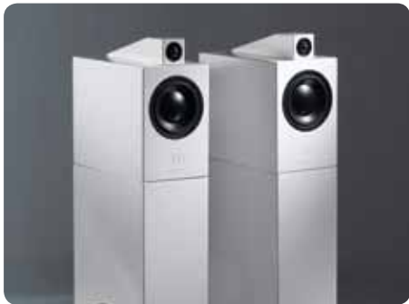
OCTAVE SIGNATURE FLOOR-STANDING

The heart of the Octave Signature is the 5¼" bass midrange driver, equipped with an enormous 3" voice coil inside of which is placed the magnet system. This unusually large voice coil configuration is three times larger than on conventional drive units of this size. Bass output from this drive unit is surprisingly deep and powerful yet very articulate.