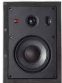
M series available sizes: 5", 6" & 8" with a frame and a 6" slim frameless