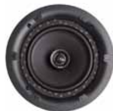
X Base in-ceiling available size: 6" frame / standard frameless