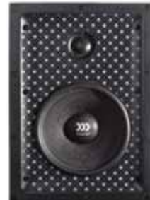
X Base series in-wall available size: 6" frame / standard frameless