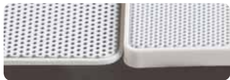
Morel slim frameless – the slimmest in the world to date (left side – Morel slim, right side – standard frameless)

The soft-dome tweeters in all SoundWall™ speakers have a 50 degrees dispersion angle for each direction making installation and alignment an easier task, all while providing a wider listening area without the need for directional/pivoting tweeters. The SoundWall series "wall-to-wall" sound stage will appeal to those who enjoy a magnificent performance whilst hiding the source.