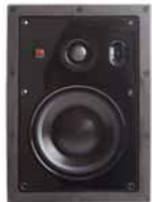
H series available sizes: 5", 6" & 8" with a frame and a 6" slim frameless