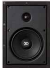
X series in-wall available size: 6" frame / slim frameless