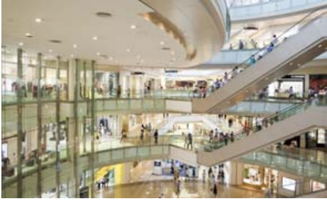
Retail Shopping Malls with high noise level require radios with good noise reduction.