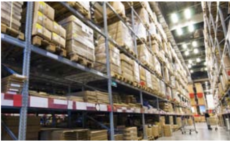
Warehouse A durable battery allows for full shifts without the need to recharge.