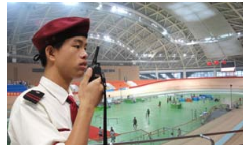
Rent The rent function is necessary for rent industry.