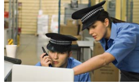
Security Enriched with several encryption types PD50X/56X will make your communication more private.