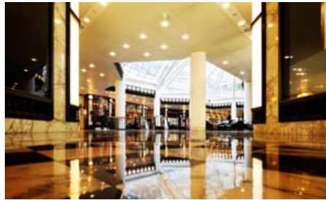
Hotel Heavy communication traffic require more effective use of frequency resources.