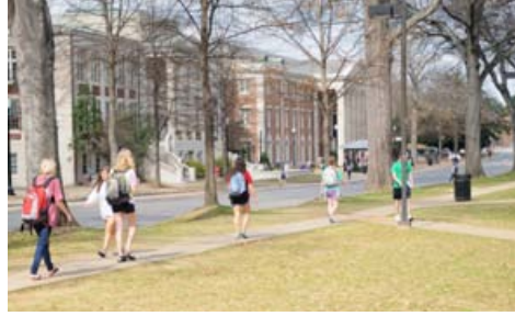
Education PD50X/56X have compact size for easy use that is capable of reaching long communication distance of a school or university campus.