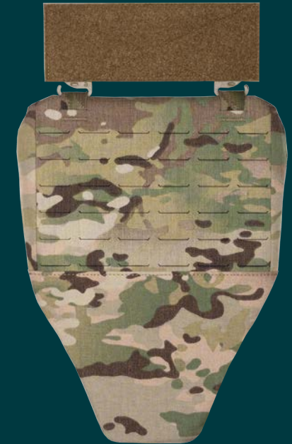
Groin Panel MOLLE (Front)