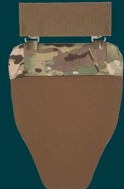
Groin Panel MOLLE (Back)