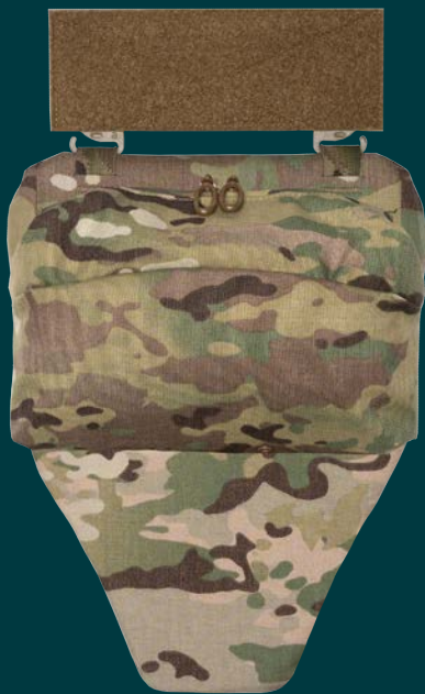
Groin Panel MOLLE with General Purpose Pocket - 6x9