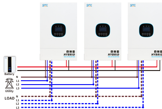
3 Phases parallel connection

Battery overcharging, Over-discharging, Overloading, Short-circuiting, and auto restart while AC is recovering. This ensures optimal system safety and longevity.