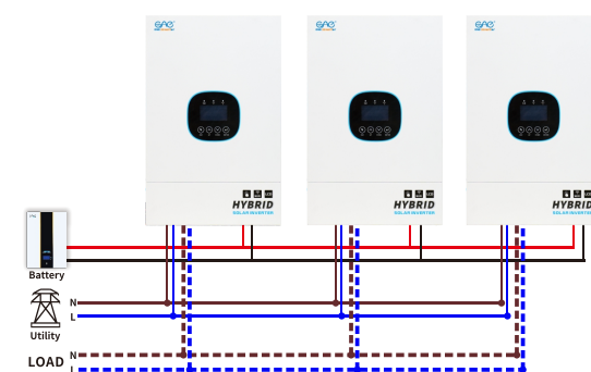
Add Power Parallel Connection