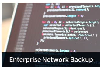
Enterprise Network Backup