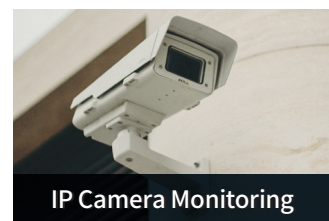
IP Camera Monitoring