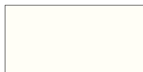
WHITE (RAL 9010)