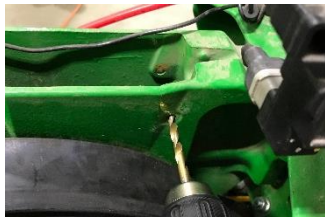
Figure 1: Drill out hole in shank.

John Deere 2100 or 1100 pre-2015, with stamped steel shank, follow instructions below: