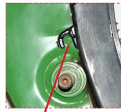
Hook – install 700138 here

Step 2 Make sure the area around the pin where the seed tube hook is clear of dirt and debris. Install the WaveVision seed tube assembly into the row unit making sure that the hook is over the pin . Secure the tube with the pin and clip. Route the cable securely and connect the weatherpack to the planter harness.