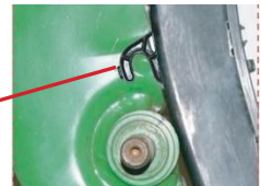
Hook - Install 700138 here.

Note: If there is space on the hook to allow installation of the 700138 Hook Filler, it is recommended it be installed to limit the movement of the Wavevision sensor to prevent it from contacting the opening discs.