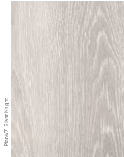
Plank/T Silver Knight