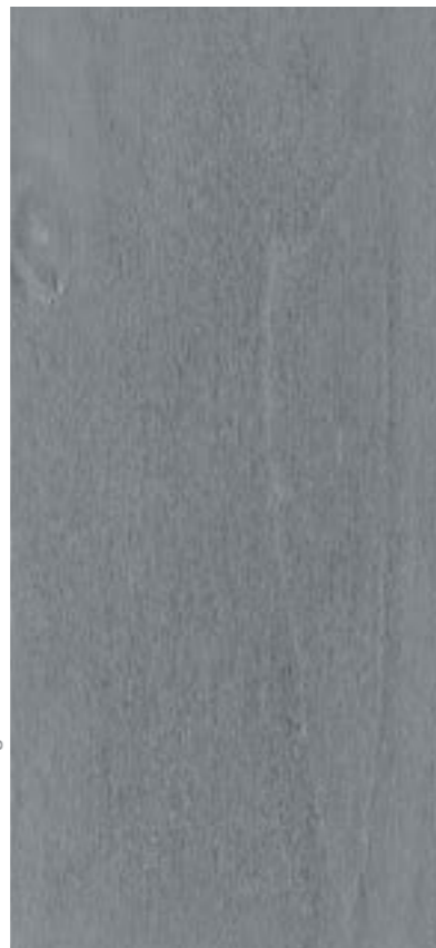
Plank/T Silver Knight