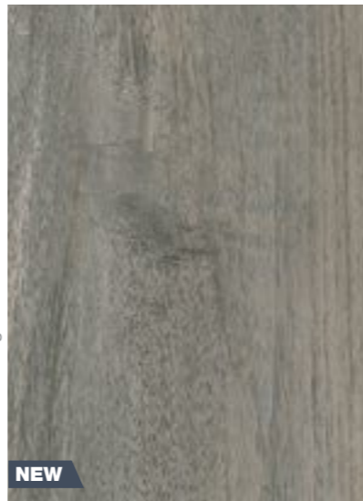
Plank/T Silver Knight