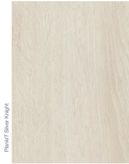
Plank/T Silver Knight