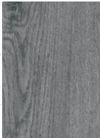
Domino 2.0 | Plank/T | Ideal Silver Knight