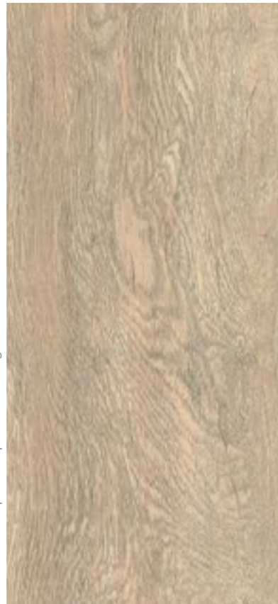
Domino 2.0 | Plank/T | Ideal Silver Knight