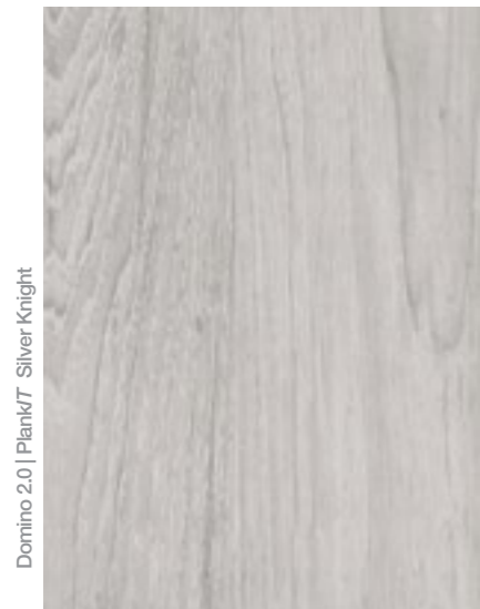
Domino 2.0 | Plank/T Silver Knight