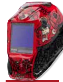
VIKING™ 3350 Mojo™