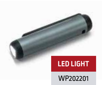
LED LIGHT WP202201

LINCOLN ELECTRIC Helmet BackPack Great for protecting your welding helmet! Lightweight Storage Carrying Bag.