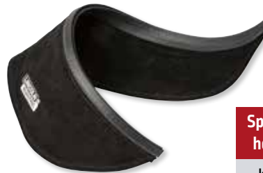
Split leather helmet bib KP3729-1