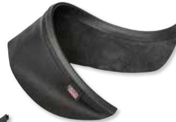
Grain Leather Helmet Bib KP3730-1