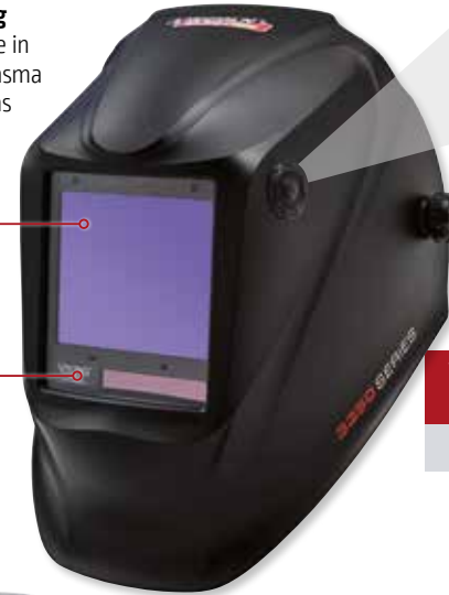
VIKING™ 3350 BlackMat

Low-profile external grind button provides seamless transition between weld & grind mode