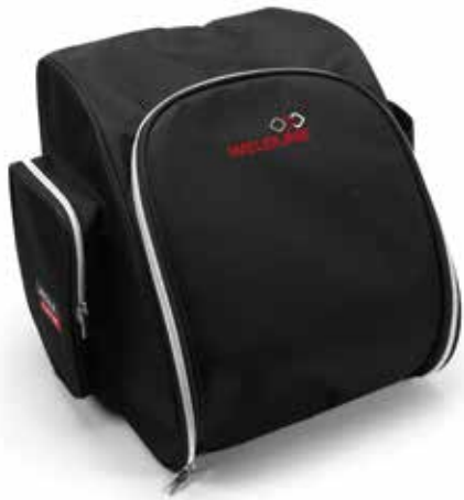
HELMET BACKPACK WP202203

LINCOLN ELECTRIC Helmet BackPack Great for protecting your welding helmet! Lightweight Storage Carrying Bag.