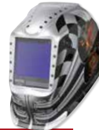
VIKING™ 3350 Motorhead™