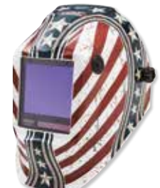
VIKING™ 3350 Dardevil