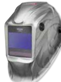
VIKING™ Heavy Metal®