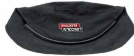
FLAME RETARDANT COTTON EXTENDED PROTECTION WP202204

LINCOLN ELECTRIC Flame retardant cotton extended protection for head with Press Fit silicone Seal