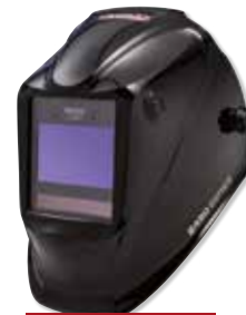
VIKING™ 2450 Black

WHAT'S INCLUDED: Comes with helmet bag, bandana, 5 outside cover lenses, 2 inside cover lenses and sticker sheet.