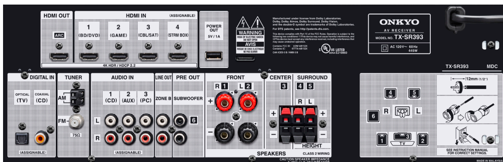
Text on receiver may vary with region.

Due to a policy of continuous product improvement, Onkyo reserves the right to change specifications and appearance without notice. Manufactured under license from Dolby Laboratories. Dolby, the double-D symbol, Dolby Atmos, Dolby Surround, Dolby Vision, and Dolby TrueHD are trademarks of Dolby Laboratories. For DTS patents, see http://patents.dts.com . Manufactured under license from DTS, Inc. DTS, the Symbol, DTS and the Symbol together, DTS:X and the DTS:X logo, DTS Surround, DTS Virtual:X logo, DTS Neural:X and the DTS Neural:X logo, and DTS-HD Master Audio and the DTS-HD Master Audio logo are registered trademarks or trademarks of DTS, Inc. in the United States and/or other countries. © DTS, Inc. All Rights Reserved. The terms HDMI and HDMI High-Definition Multimedia Interface, and the HDMI Logo are trademarks or registered trademarks of HDMI Licensing Administrator, Inc. in the United States and other countries. The Bluetooth® word mark and logos are registered trademarks owned by Bluetooth SIG, Inc. Products displaying the Hi-Res Audio logo conform to the Hi-Res Audio standard as defined by Japan Audio Society. The Hi-Res Audio logo is used under license from Japan Audio Society. AccuEQ and Music Optimizer are trademarks of Onkyo Corporation. All other trademarks and registered trademarks are the property of their respective holders.