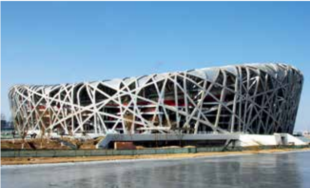
National Stadium, Beijing, China