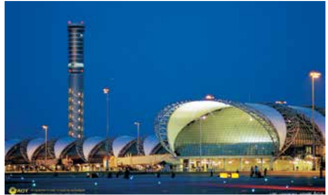
Suvarnabhumi Airport, Bangkok, Thailand