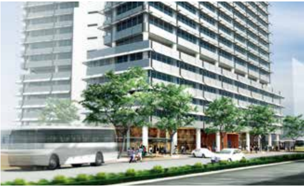
Centrepoint, Ho Chi Minh City, Vietnam