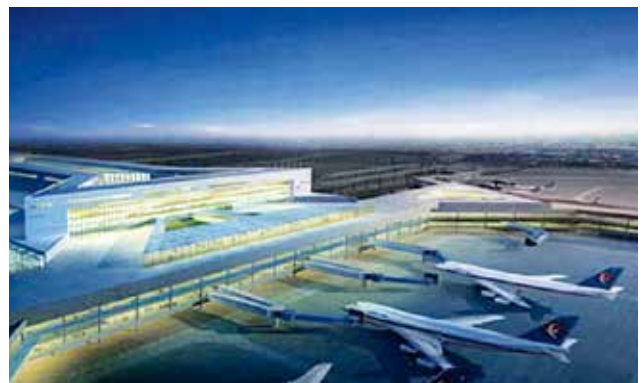
Hongqiao International Airport and Transportation Junction, Shanghai, China