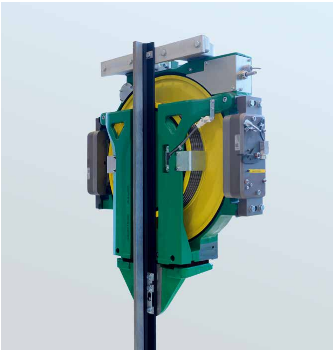
The eco-efficient KONE EcoDisc hoisting system

But the hoisting motor is not the only thing that can reduce the total energy consumption of an elevator. KONE has analyzed every function and option in order to reduce the total energy consumption.