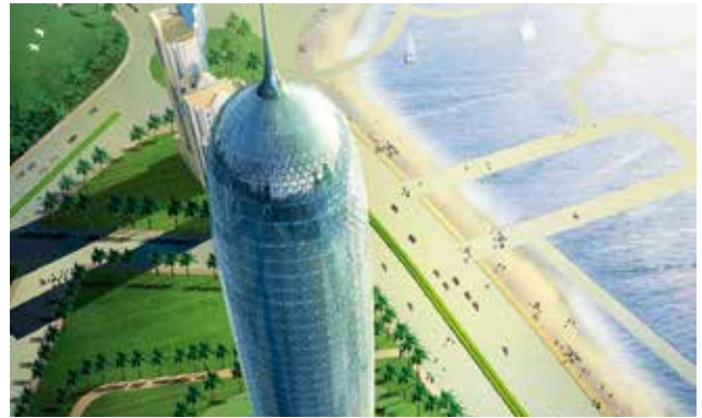
Doha High Rise, Doha, Qatar