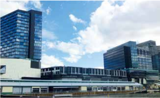
South Wharf, Melbourne, Australia