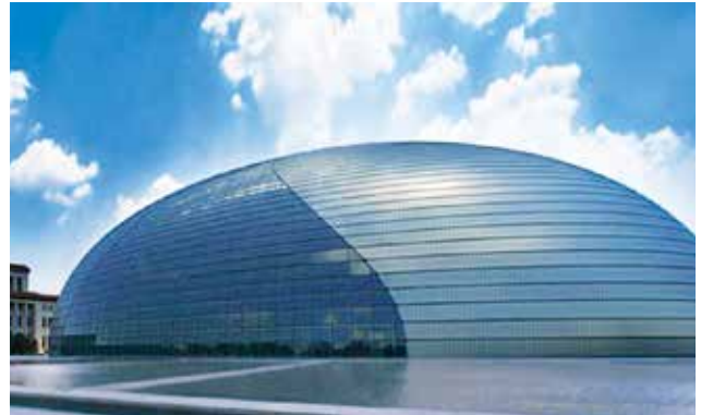
National Grand Theater, Beijing, China