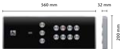
Black plastic faceplate