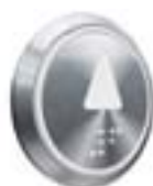
Brushed stainless steel with Braille