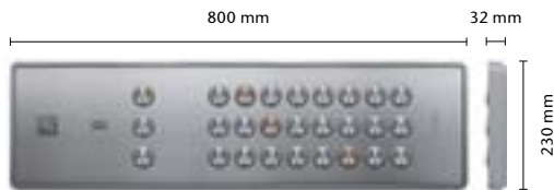
Stainless steel faceplate