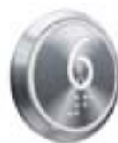
Brushed stainless steel with Braille