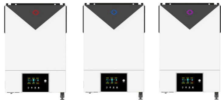
Red-Battery Mode Blue-Utility Mode Purple-PV Mode