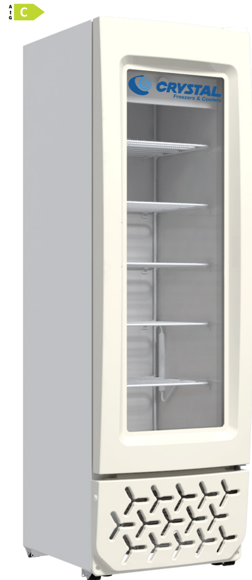
MIRA 570 x 649 x 1835 301lt