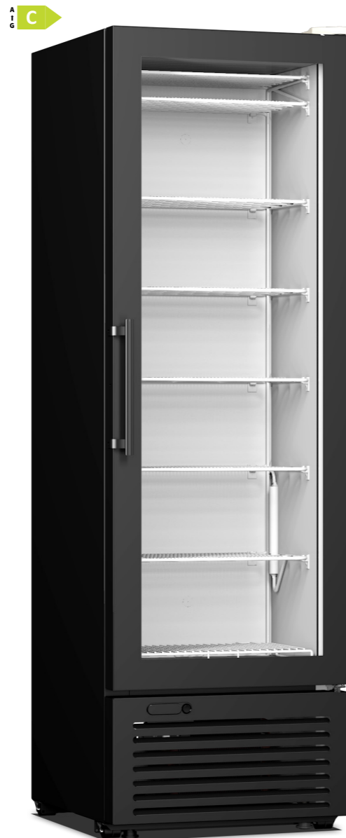
CRF 300 FRAMELESS 570 x 649 x 1835 301lt