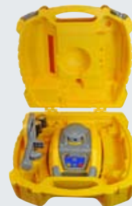
Standard case with laser and receiver only also available.