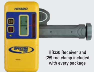
HR320 Receiver and C59 rod clamp included with every package