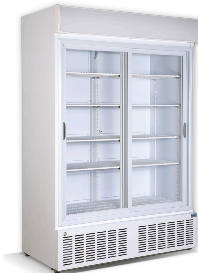
CRS 1200 1364 x 716 x 2059 1129lt