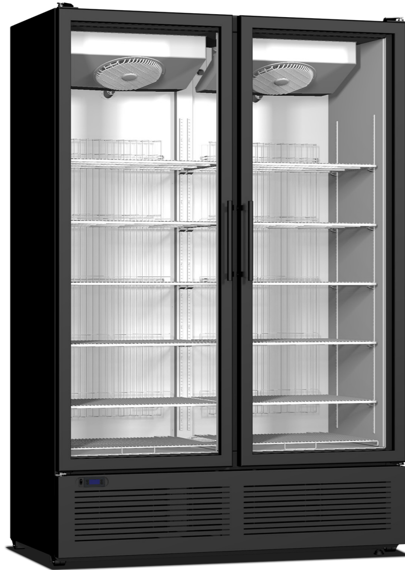
CRFV 1200 1370 x 760 x 2080 1163lt