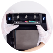
Printer Head Quick Replacement