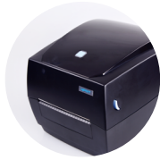
One Button, Many Functions