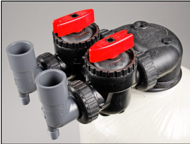
1191 In-Out Head shown with optional V3006 Bypass Assembly and V3007-01 3/4" x 1" PVC Solvent Elbow Assembly