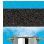
Impervious to water vapour