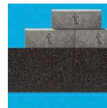
High compressive strength