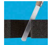
Easy cut to shape