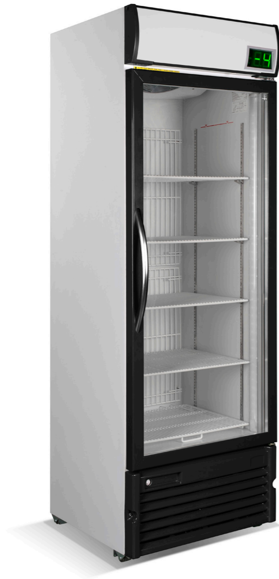
CR 500 SZ 667 x 620 x 2018 477lt