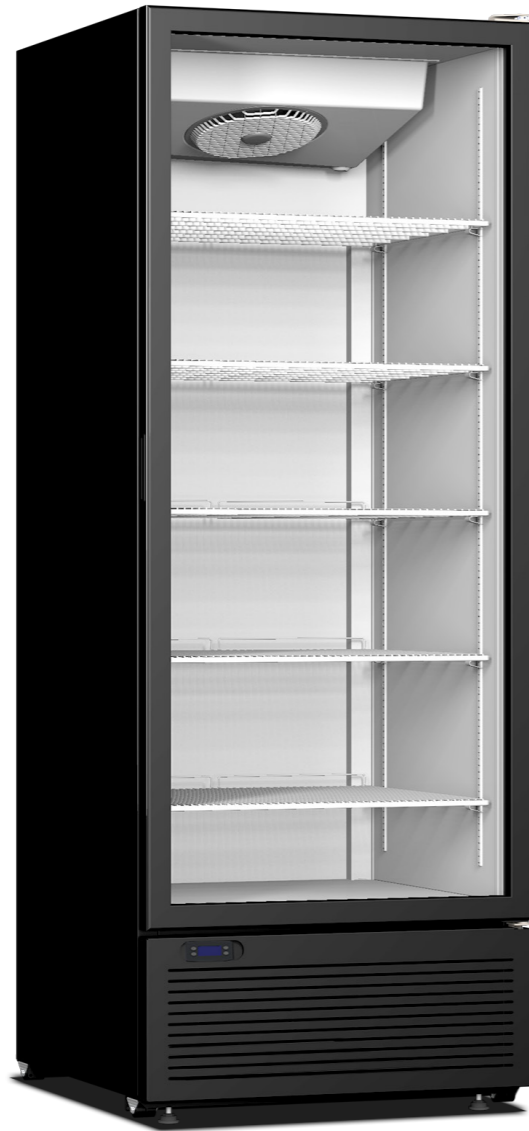
CR 800 770 x 790 x 2080 783lt