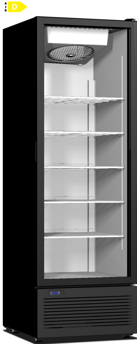
CR 500 667 x 620 x 2018 477lt