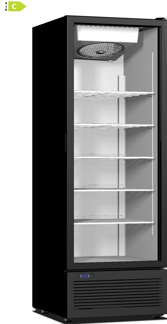
CR 600 667 x 716 x 2018 567lt