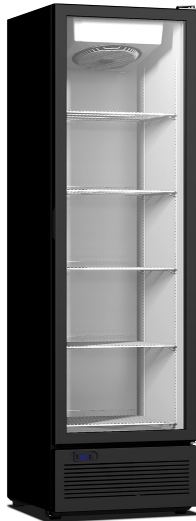
CR 450 595 x 595 x 2018 435lt