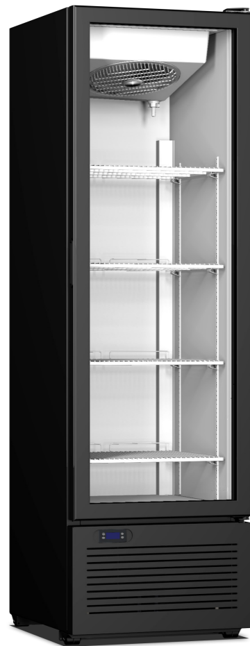
CR 300 530 x 595 x 1793 314lt