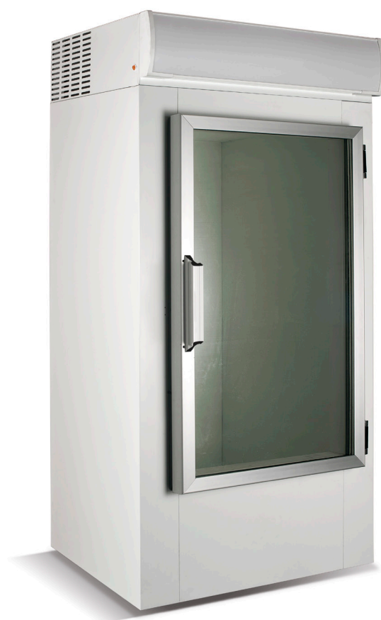
ICEBOX 24 GD 770 x 765 x 1902 590lt