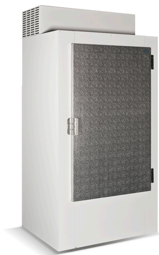
ICEBOX 30 900 x 765 x 1902 703lt