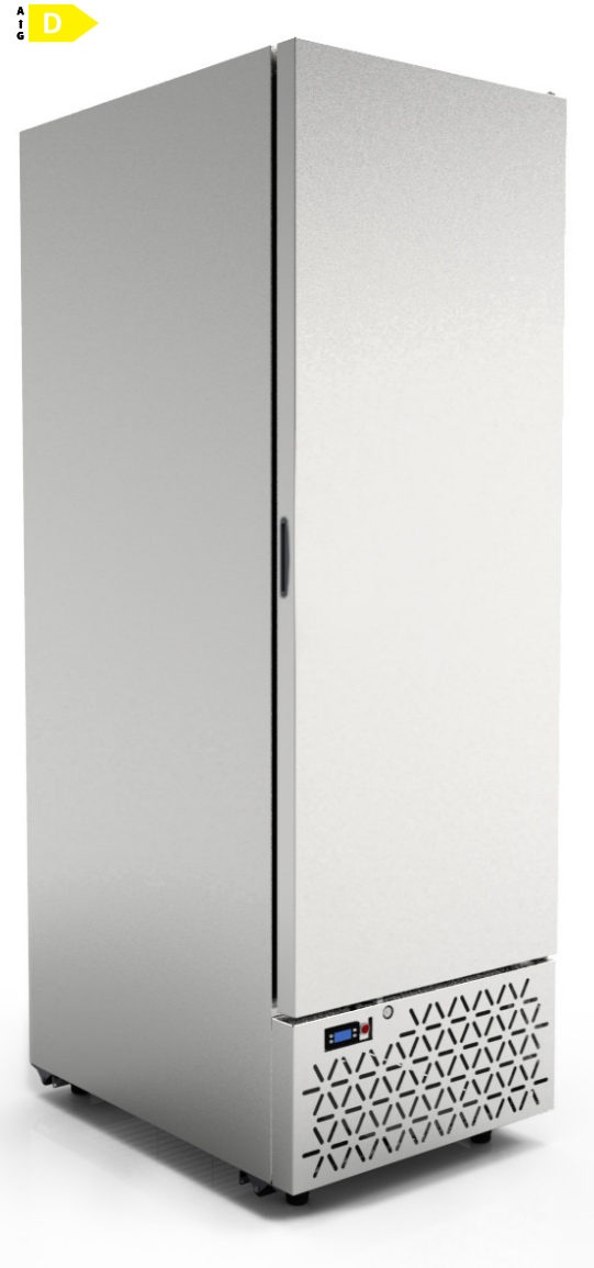
GELOBOX INOX 667 x 895 x 2020 658lt