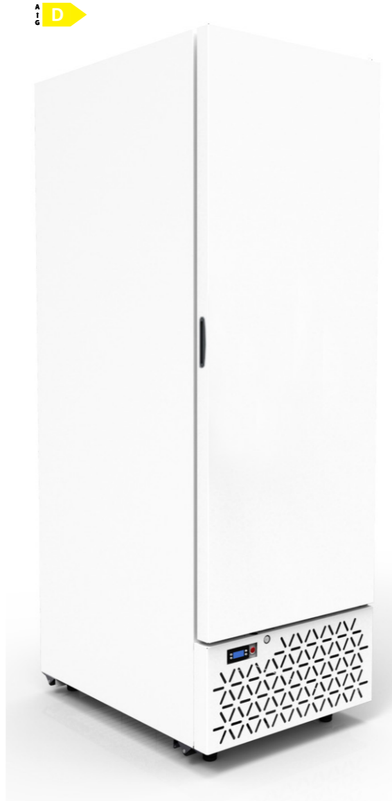
GELOBOX WHITE 667 x 895 x 2020 658lt