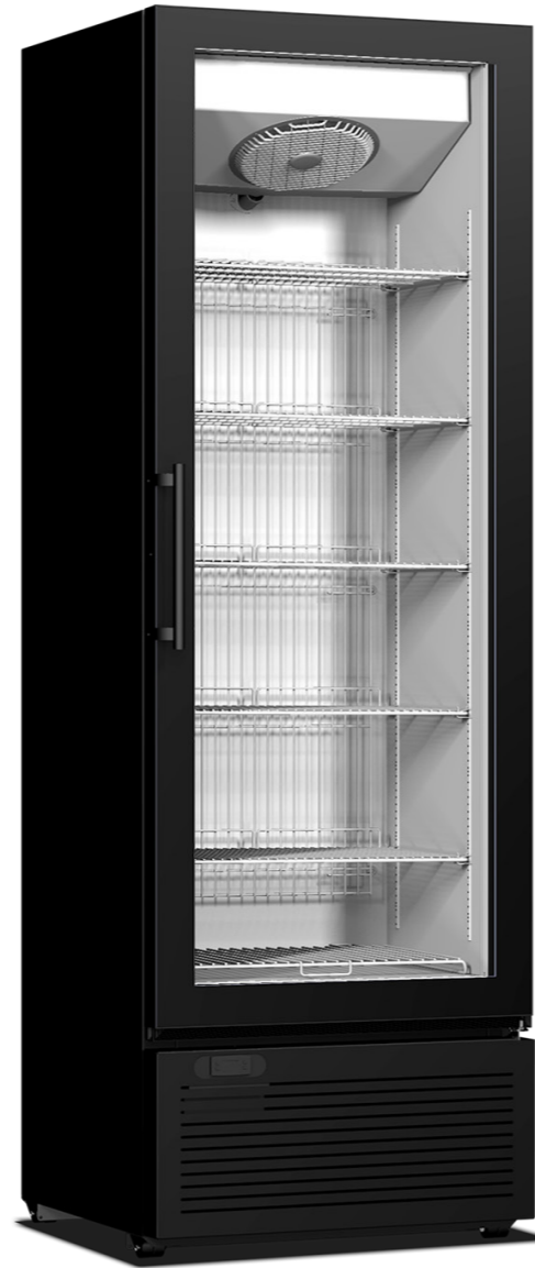
CRFV 500 FRAMELESS 667 x 680 x 2018 420lt