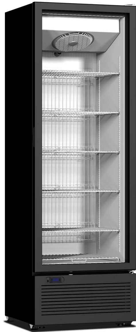
CRFV 500 667 x 680 x 2018 420lt