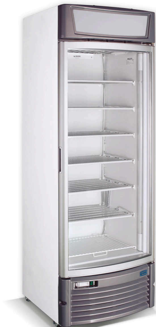
CRF 400 CURVED 667 x 667 x 2018 454lt