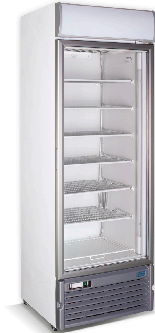
CRF 400 667 x 620 x 2018 417lt