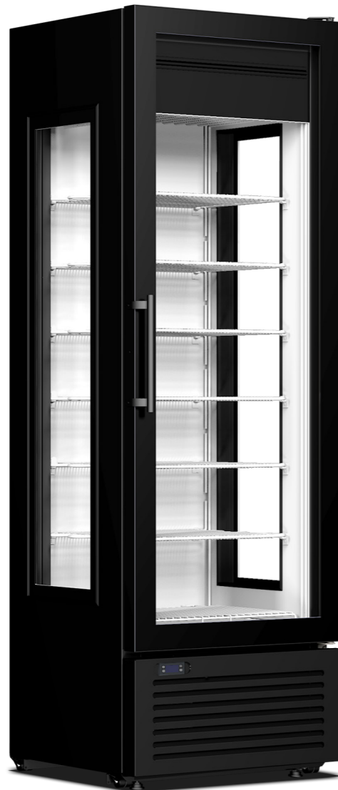
CRF 400 3D GLASS 667 x 620 x 2018 417 lt