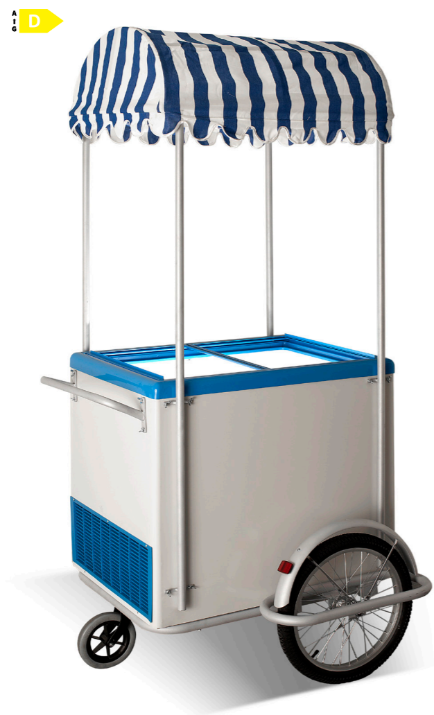
ICE CREAM CART 1050 x 1120 x 2300 6 places