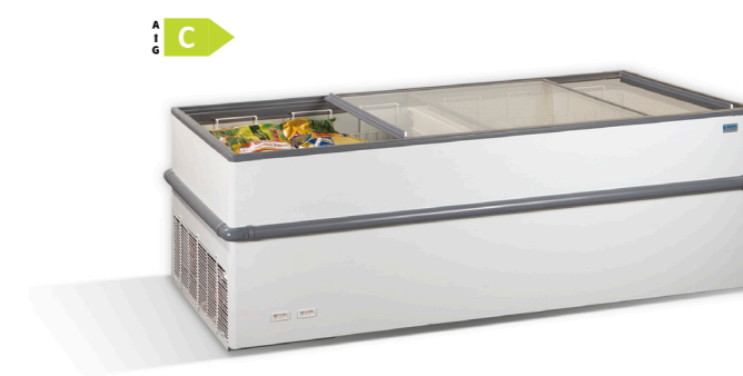
CRYSTALLITE 20 2004 x 914 x 840 800lt