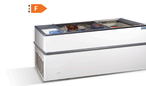
CRYSTALLITE 15 1554 x 914 x 840 600lt

CRYSTALLITE 15 • CRYSTALLITE 20 • CRYSTALLITE 25