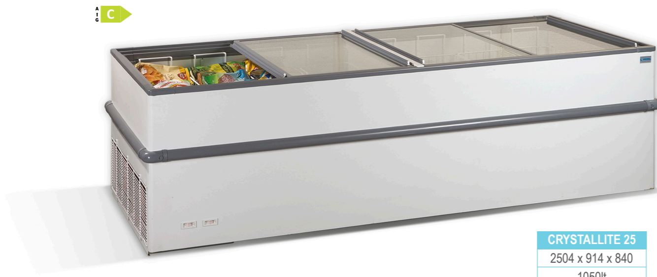
CRYSTALLITE 25 2504 x 914 x 840 1050lt