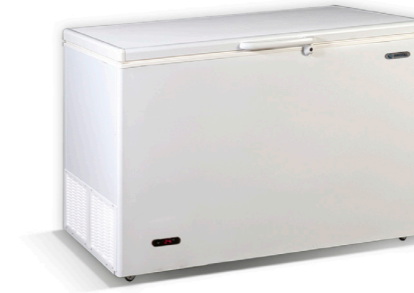
IRAKLIS 36 1184 x 731 x 869 342lt