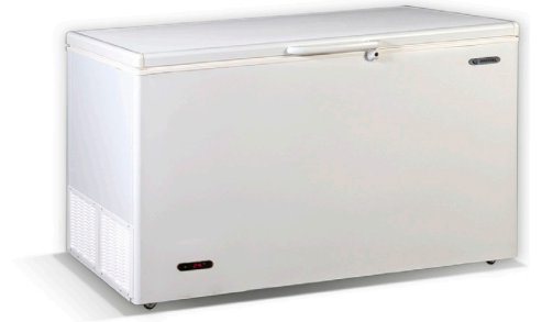
IRAKLIS 46 1388 x 731 x 869 417lt