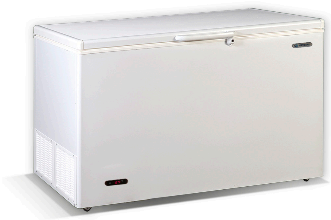
IRAKLIS 56 1654 x 731 x 869 515lt