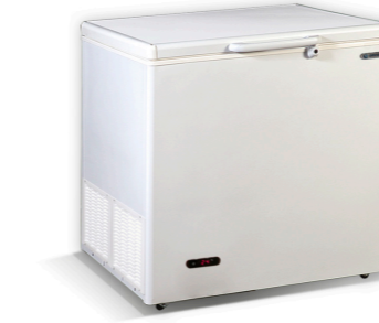
IRAKLIS 26 909 x 731 x 869 240lt