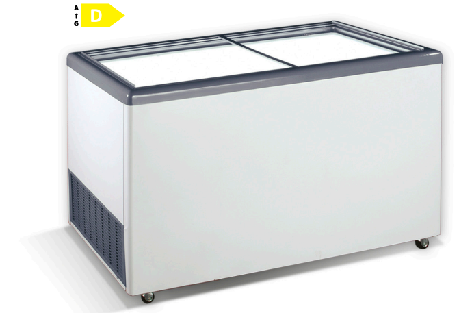
EKTOR 56 SGL 1654 x 644 x 895 535lt