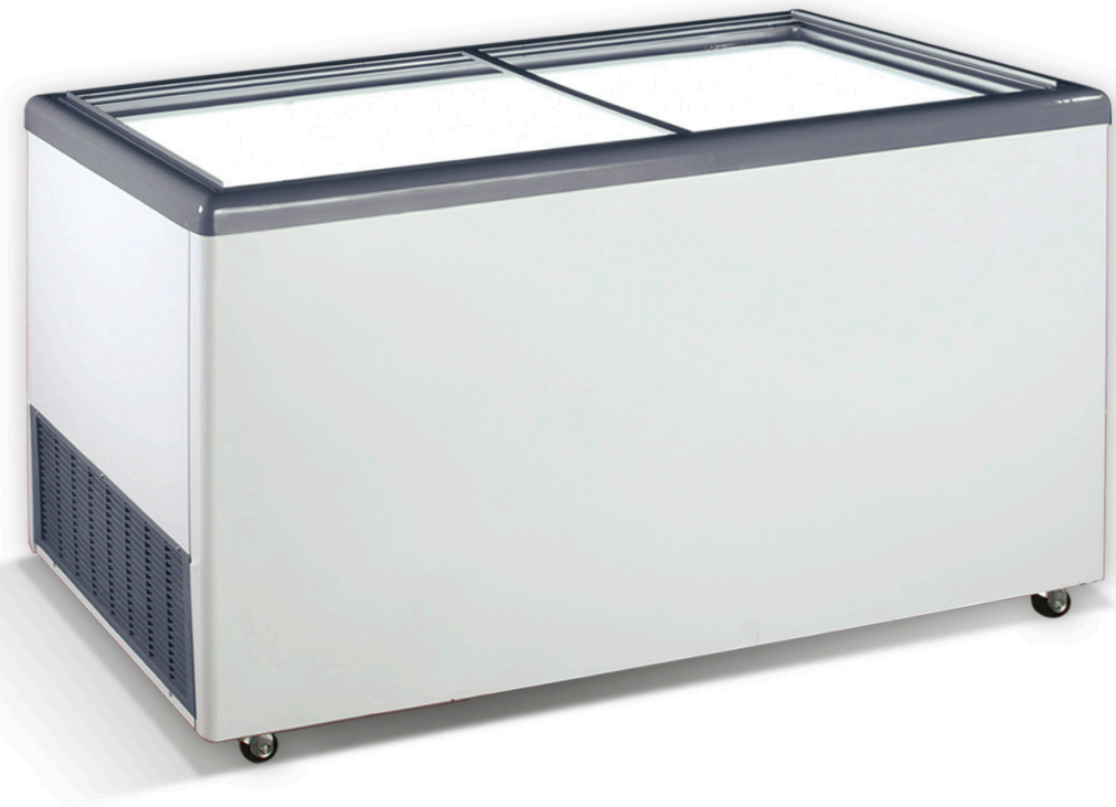
EKTOR 60 SGL 1754 x 644 x 895 575lt