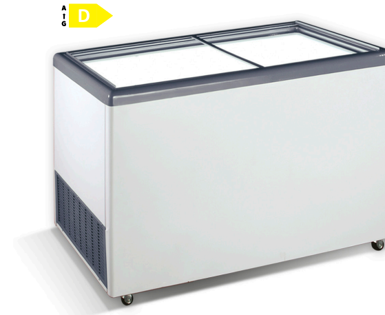
EKTOR 46 SGL 1439 x 644 x 895 445lt

EKTOR 46 SGL • EKTOR 56 SGL • EKTOR 60 SGL