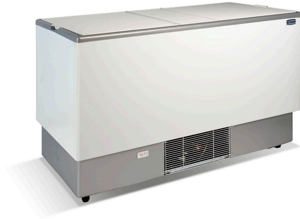
ATLAS 46 1439 x 684 x 999 438lt