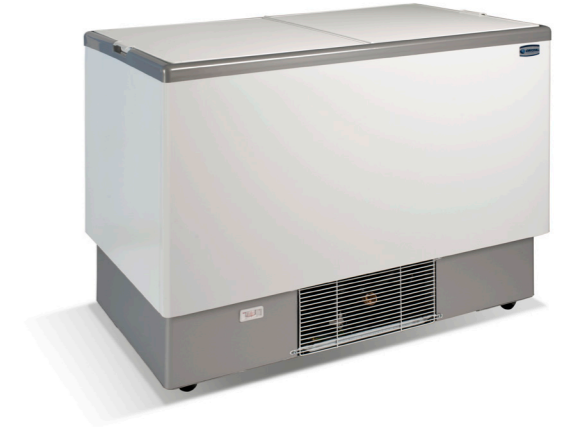
ATLAS 36 1184 x 644 x 999 328lt