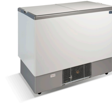
ATLAS 26 909 x 644x 999 246lt