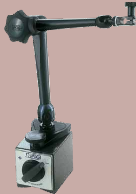
DG10503 / DG10533 Overall arm length 232.5 mm