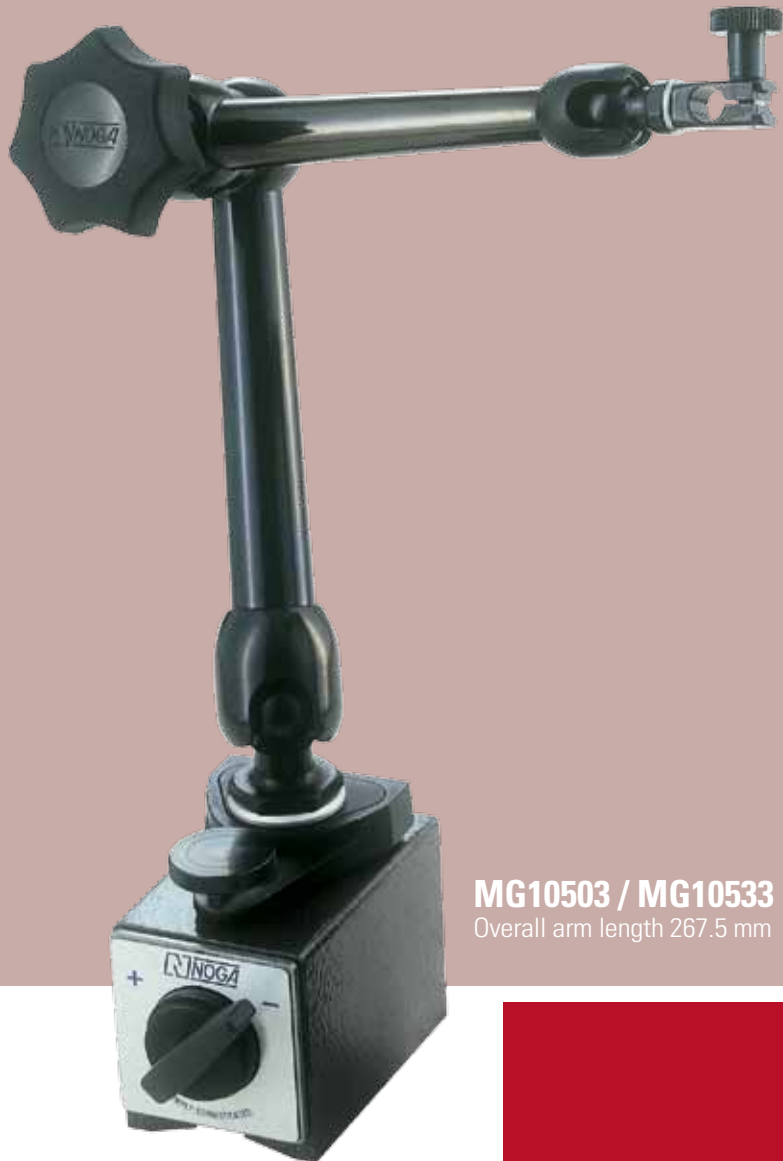
MG10503 / MG10533 Overall arm length 267.5 mm