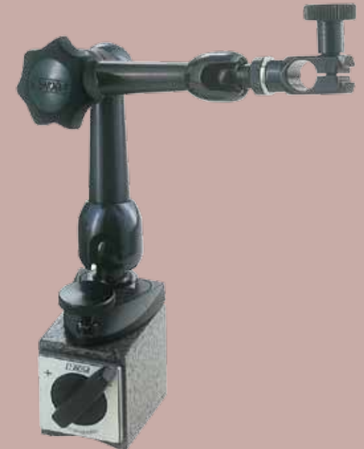
NF10403 / NF10433 Overall arm length 128.5 mm