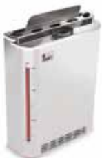
Mini Steam mate

You may choose between a Mini or Scandia Steam Mate.