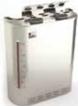
Scandia Steam mate