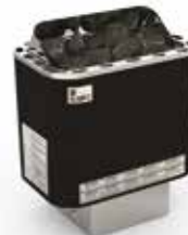
Fiber Coated Nordex