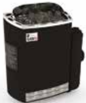
Fiber Coated Mini

Fiber Coated Casings are available for all Stainless models and their Combi versions. Fiber coating is also available for the Steam Mate and the Cumulus heater.