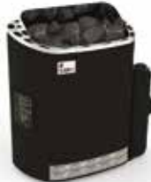
Fiber Coated Scandia