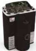
Fiber Coated Mini X