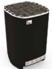
Fiber Coated Savonia