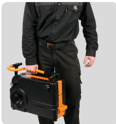
Easy to carry with you

The machine is all about the operator !!