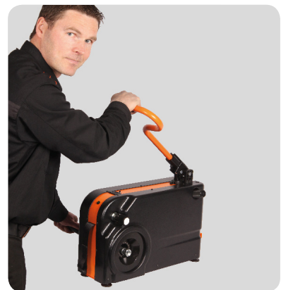
Ergonomic work positioning.