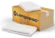
BLS-1058 4 Pack Longopac Sleeve (4 x 20 m)