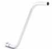
CF722122 Chromed Hand Grip 50 mm