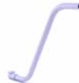
CF722025 Aluminium Hand Grip 50 mm