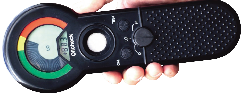
Red/Amber/Green Numerical Value

Oilcheck is available with a numerical display to show positive or negative increases in dielectrics.