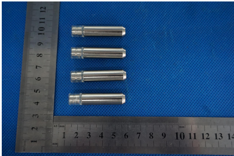
Back of sample

深圳市环通检测技术有限公司 Shenzhen HTT Technology Co.,Ltd.