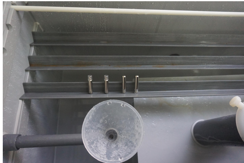
Test placement area

深圳市环通检测技术有限公司 Shenzhen HTT Technology Co.,Ltd.