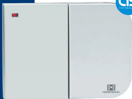
ASR-RF receiver located near boiler.

OPERATING FREQUENCY 868Mhz AS2-RF - Battery ASR-RF - Mains CONTACT RATING ASR-RF 3(1) Amps 230-240V AC CONTACT TYPE Micro dis-connection Voltage free SUPPLY 230-240V AC 50Hz OPERATING TEMPERATURE RANGE 0°C to +40°C BATTERY TYPE Lithium + 3AA (AS2-RF) DOUBLE INSULATED Yes Pollution Degree 2 ENCLOSURE PROTECTION IP 30 TEMPERATURE CONTROL RANGE +5°C to +30°C STANDBY TEMPERATURE +5°C to +10°C CASE MATERIAL Thermoplastic flame retardant DIMENSIONS Width 120mm x Height 90mm x Depth 32mm DISPLAY Liquid crystal, back lit CLOCK 24 hour DISPLAYED TIME ADJUSTMENTS 1 minute steps SWITCHED TIME ADJUSTMENTS 15 minute steps PROGRAMME SETTINGS Auto, Standby OPERATING PERIODS PER DAY Warm - 3 per day OVERRIDE Instant warm/cool MOUNTING Industry standard backplate