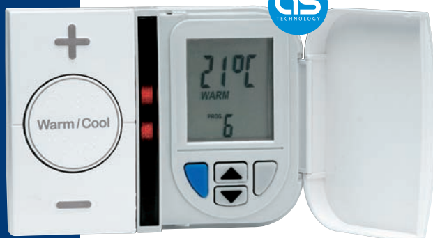
AS2-RF Control unit installed in normal thermostat location