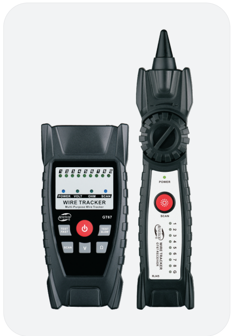
Standard:Q/GMY 020-2015 Version:GT67-EN-01