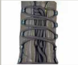
TUCK AWAY LACE ENDS