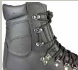
NON HOOK OPTION