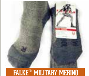
FALKE® MILITARY MERINO WOOL SOCKS