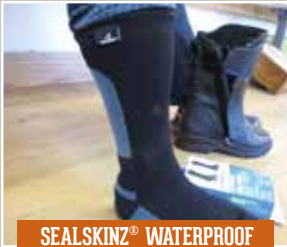
SEALSKINZ® WATERPROOF MERINO® SOCKS