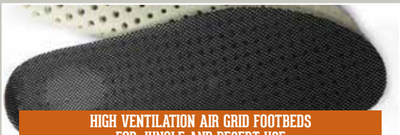
HIGH VENTILATION AIR GRID FOOTBEDS FOR JUNGLE AND DESERT USE