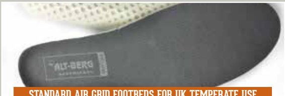
STANDARD AIR GRID FOOTBEDS FOR UK TEMPERATE USE