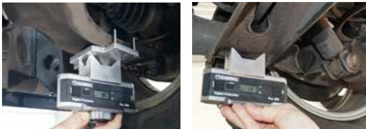
Application examples (measuring adapter ③ and crown adapter ①)