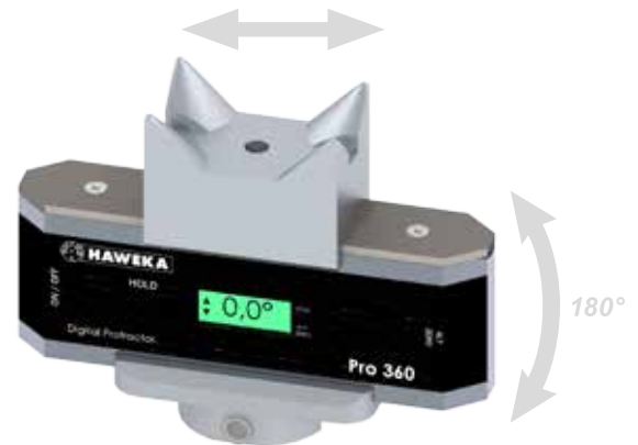
The crown adapter can be moved laterally. Double-sided application area, 2 position adapters available (rotatable by 180°).

The device enables measurement of the inclination angle of the transverse control arm or the drive shaft to the horizontal. The measured values can be used as further input in electronic axle alignment systems and are important for correct setting of the camber, toe and castor.