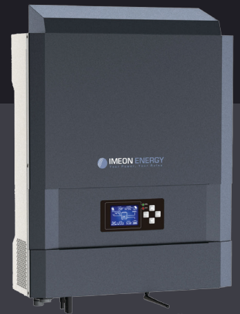
IMEON 3.6 Up to 4kWp Single phase