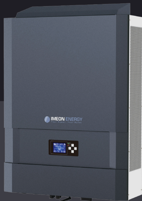
IMEON 9.12 Up to 12kWp Three phase