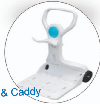
Option: LED & Caddy